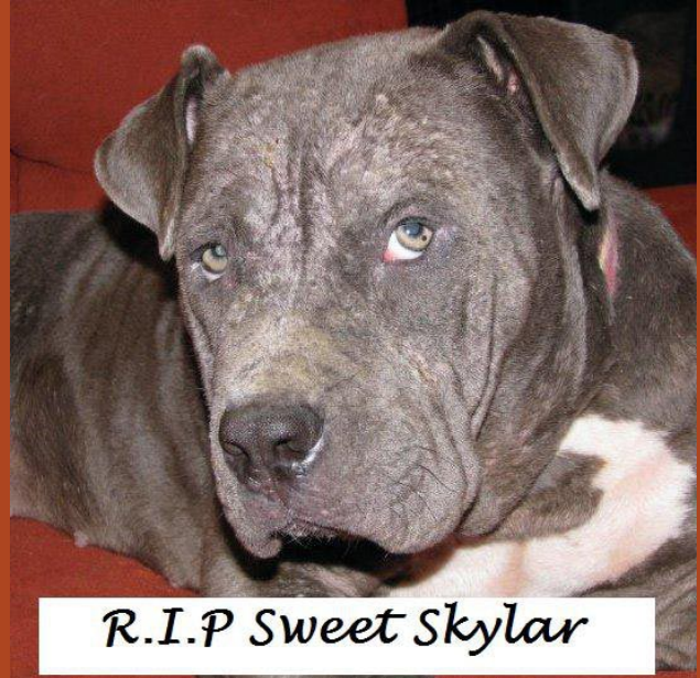
R.I.P Sweet Skylar