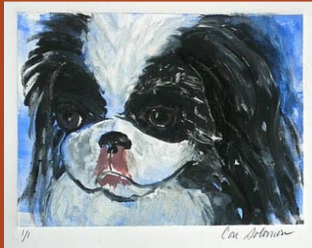
Japanese Chin Dog Art Chin-Wow by Cori Solomon

A percentage of sales, as determined by each artist, is donated to BBR!