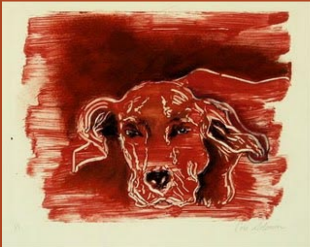
Red Dog Daze By Cori Solomon

A percentage of sales, as determined by each artist, is donated to BBR!