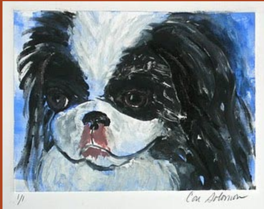
Chin-Wow By Cori Solomon

A percentage of sales, as determined by each artist, is donated to BBR!