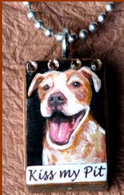
Kiss My Pit Pendent (left)