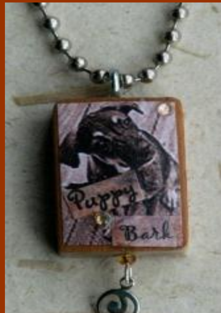
Puppy Bark Pendent (right)